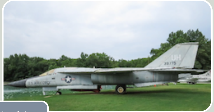
F-4 and F-111 on outdoor display at Aviation Challenge campus

USSRC have the funding to restore them. Our chapter has been talking about restoring them for the last 5 years or so but could seem to get no traction. About 1 year ago, we decided to go full-bore to get those aircraft restored, using the mantra, “if not us helping to restore them, then who would do it?”