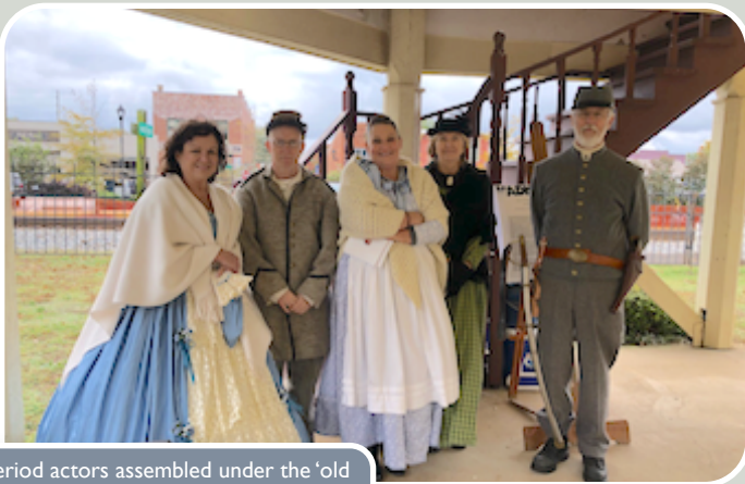
Period actors assembled under the 'old town' Madison Roundhouse.

For those of us who served in Europe, we remember a “Volksmarch” as being a fun time outdoors with friends and family and a time to learn all about a town on foot instead of whizzing by in a car. The Rotary of Madison decided to bring that European experience to downtown Madison for the first time on Oct 27, 2018. There seemed to be no better way to showcase Madison’s business and historical districts, so they jumped in feet first and made it happen!