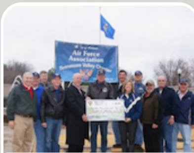
Chapter members pose as final payment of $15,000 for USAF flag is presented to Memorial's leadership on 14 Dec 2013

chapter treasurer for tax purposes. Please refer to the companion article on page 5 in this newsletter for more specific instructions on how to make a contribution to this restoration project.