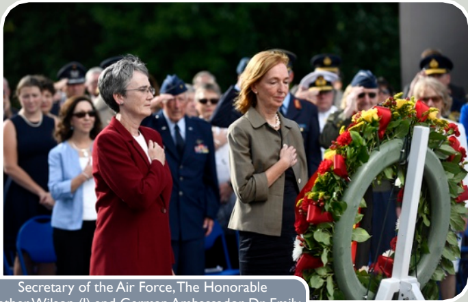
Secretary of the Air Force, The Honorable Heather Wilson (l) and German Ambassador, Dr. Emily Haber (r), jointly pay tribute to those who died in support of the Berlin Airlift.

Sunday at the National Convention, time is set aside to honor those AFA members who have passed away since the previous convention. This year was no exception, and we were pleased to see the ceremony take place at the Air Force