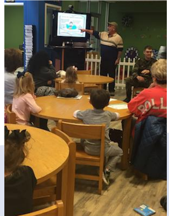
Pre-K students in Gadsden are treated to a program on airplanes and the Candy Bomber.

ACE is a program developed by CAP for K – 6 th grade teachers, which provides a series of grade-specific lesson plans on various aerospace topics. Following the completion of at least 10 of the 20 lessons, the students receive an ACE t-shirt and a certificate. It is a great program for the teachers as the lesson plans are time-tested and FREE. Students are exposed to a number of STEM ideas in a fun setting with a wide variety of activities.