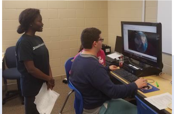
Huntsville StellarXplorers Team works solutions as they compete in the Semi-Finals.

There were two teams from the Tennessee Valley competing in this year's StellarXplorers: Huntsville High AFJROTC, and James Clemens High. Huntsville High successfully completed the Semi-finals; we wait to see if they will move on to the Prestige Round, and hopefully, on to Colorado for the finals in early April.