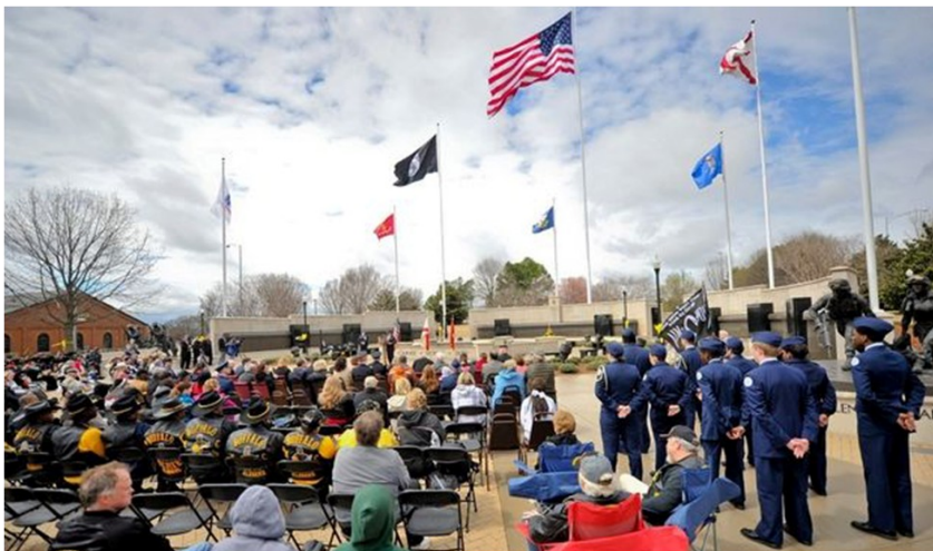
Photo from the 2014 Welcome Home Vietnam Veterans Day Ceremony

The public, young and old, are encouraged to come out and honor our Vietnam Veterans. As there will be limited seating visitors are encouraged to bring a lawn chair.