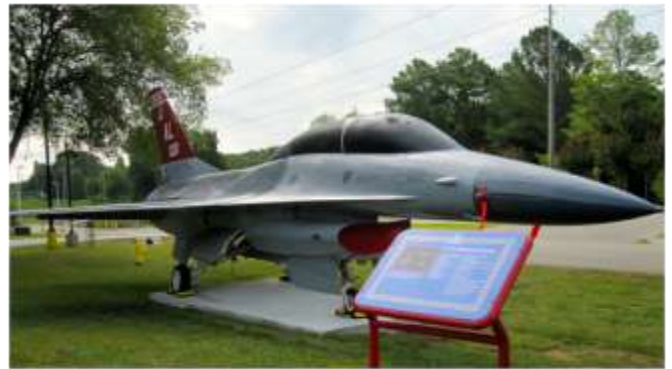
F-16 at Aviation Challenge received a face-lift and was painted in Alabama Air National Guard livery – honoring the Tuskegee Airmen, "The Red Tails."

tions, classroom training and other aviation related skills to include both water and land survival.