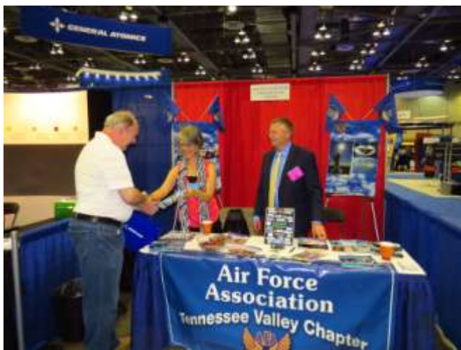
AFA members and spouses manned the Chapter at the recent 17th Annual Space and Missile Defense Symposium. Thanks to all who participated!