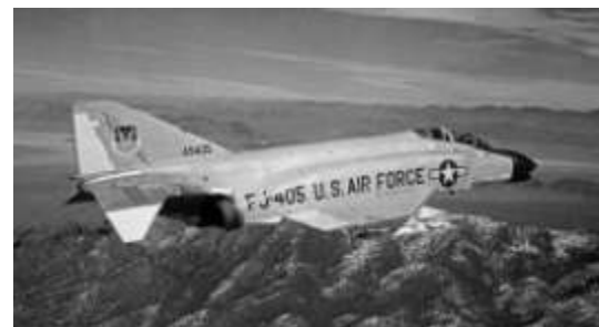
Open source photo of an AF F-4 Phantom II.