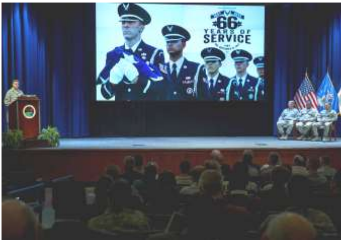
At Redstone Arsenal (above) . . .