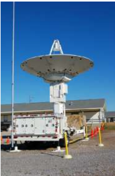
Next Generation Eagle Vision Antennae