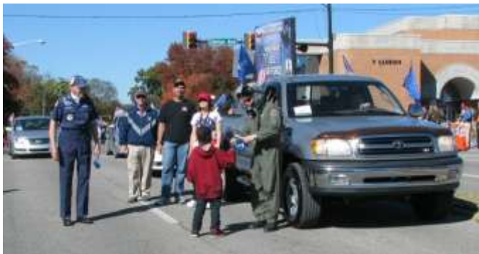
and Proudly Shook Spectators' Hands!