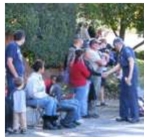
Passed Out AF Flags ...