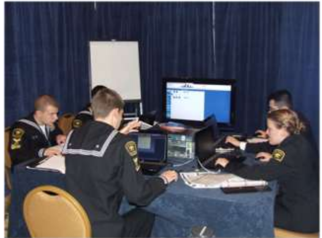
Members of Valor Division Naval Sea Cadet Corps of Gardendale hard at work. They took Top in the State and Top of all Naval Cadets in CyberPatriot V honors.

Currently in its sixth year, CyberPatriot is the premiere High School Cyber Defense competition created to inspire students toward careers in cyber security or other science, technology, engineering, and mathematics (STEM) disciplines critical to our