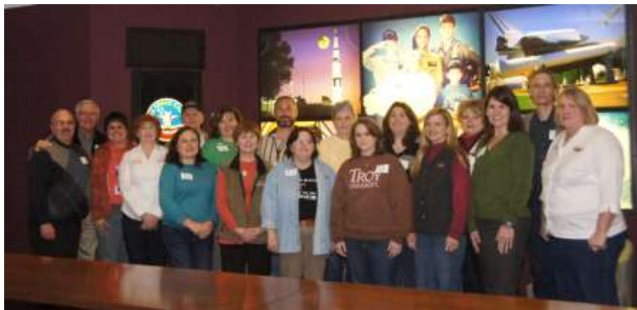
Teachers and staff pose at the U.S. Space and Rocket Center during the Tennessee Valley Chapter's (first-ever) Aerospace Education and Science, Technology, Engineering, and Math (STEM) Workshop.