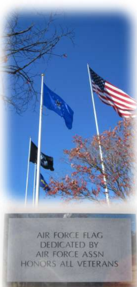
AF Flag Flies Proudly!