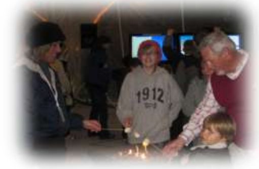
Left: Everyone enjoyed the Aviation Challenge festivities!