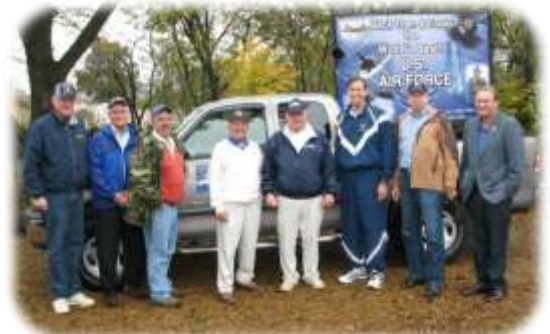
Right: Veterans' Day Parade participants who braved the rainy weather!