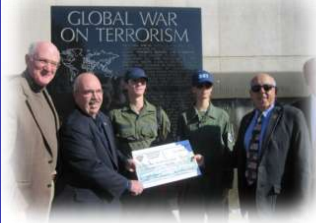
Presentation of second installment payment of $4,000 for USAF Flag at Huntsville Madison County Veterans Memorial. Only $5,000 more to raise! Thank you for your support!

You can follow the Chapter's latest activities on Facebook. Just "like us" at AFA TVC 335.