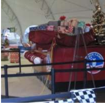
Last year's "Santa's Pit Row" at the Botanical Gardens