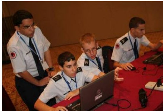
Cadets face cyber threat challenges during Cyber Patriot I

For Cyber Patriot II, each team of five cadets is led by a Cyber Patriot coach. The coach is provided training resources in network security principles and techniques. Through a simple Internet connection with their own personal com-